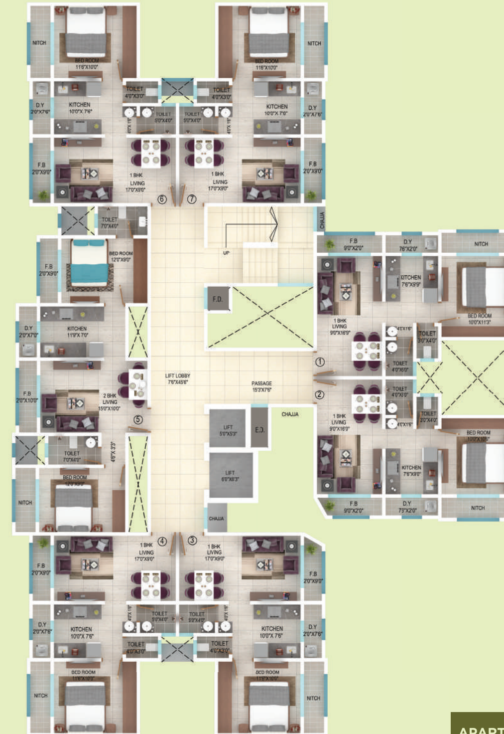
Floor Plan - D Wing