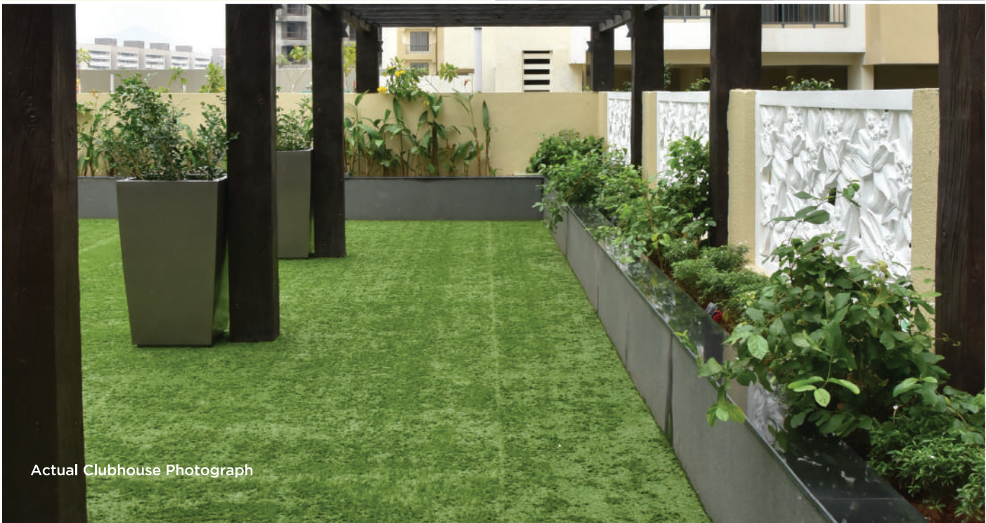
Actual Clubhouse Photograph