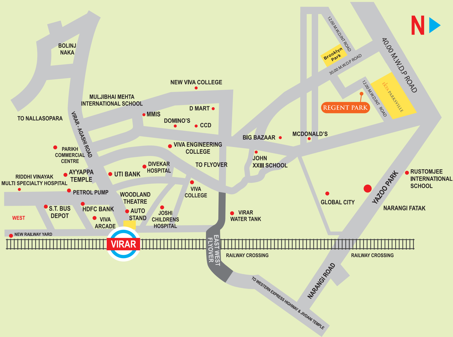
Location plan not to scale