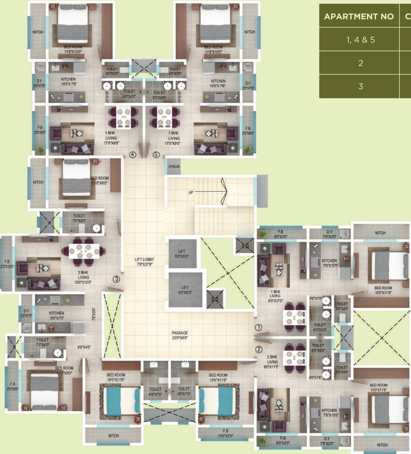
Floor Plan - B Wing