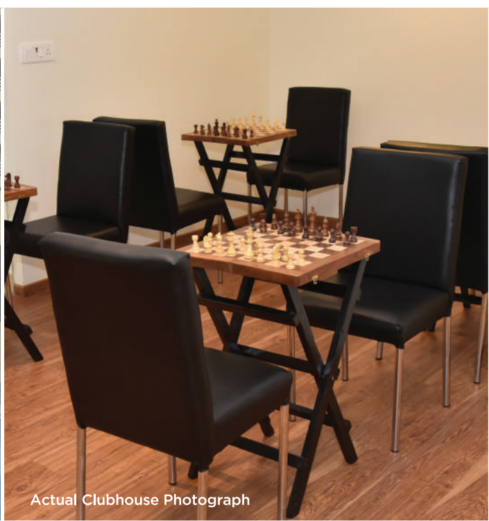
Actual Clubhouse Photograph