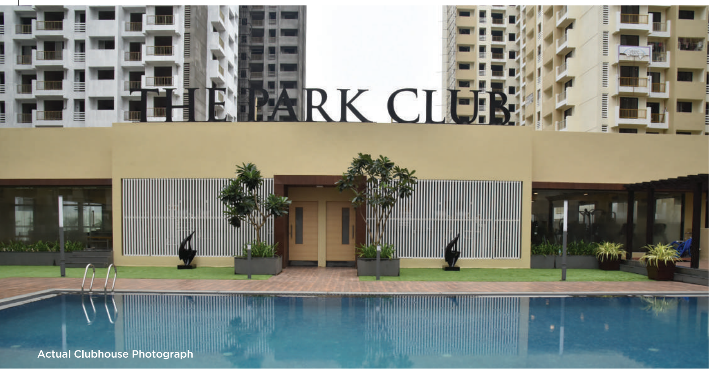
Actual Clubhouse Photograph