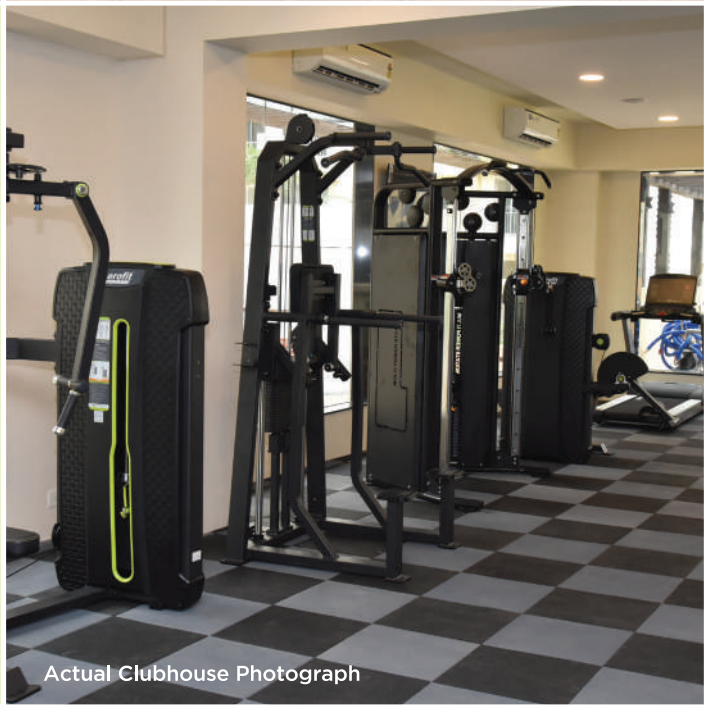
Actual Clubhouse Photograph