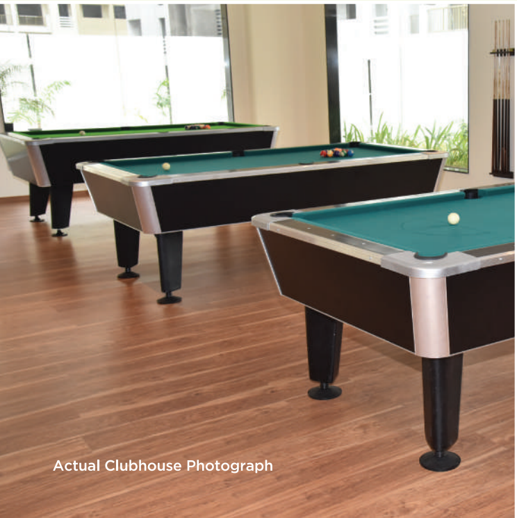
Actual Clubhouse Photograph