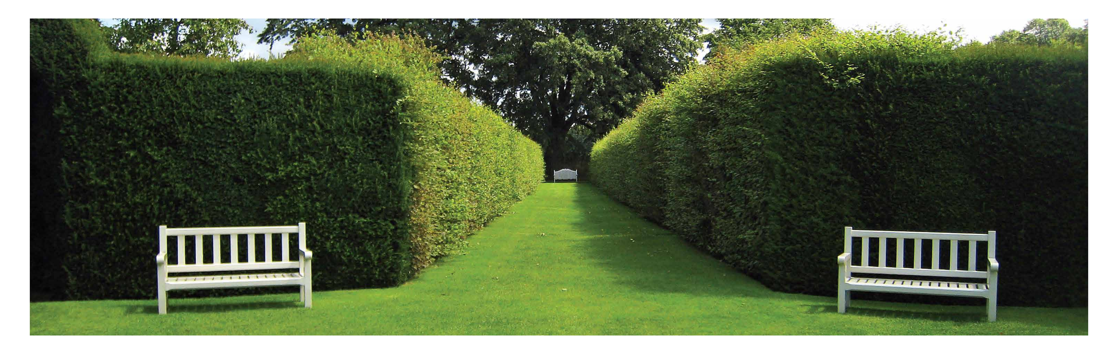
FROM WAKING UP TO THE VERDANT GREENS OF FIVE GARDENS...