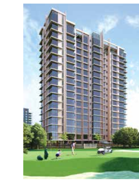
PANORAMA 16 storeyed residential building with 3 & 4 BHK premium apartments in Chembur.