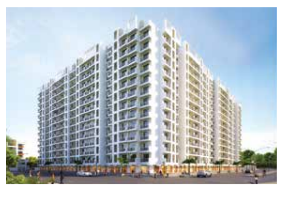
EKTA PARKSVILLE 15 storey residential towers with 1, 2 & 3 BHK Classic and Platinum apartments at Virar (W).