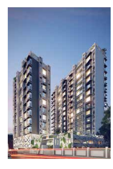
EKTA TRINITY 14 storey residential towers with 2 & 3 BHK luxury apartments at Santacruz (W).