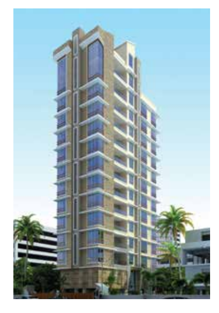
LÈGRANZ A residential tower with 4 BHK ultra-luxurious apartments in Chembur.