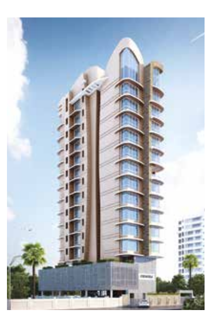
EUDORA 14 storey residential tower with 4 BHK lavish apartments at Khar (W).