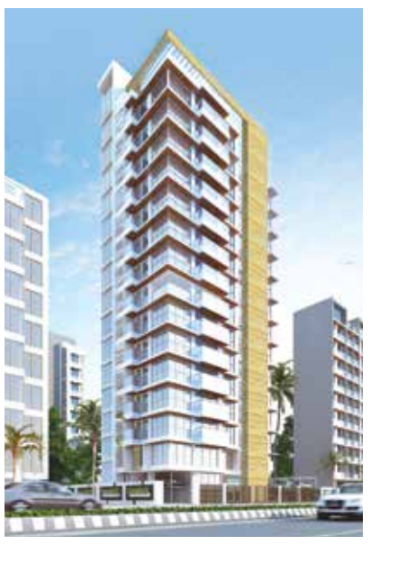
ESTRELLA 14 storey residential towers with 4 BHK iconic residences at Bandra (W).