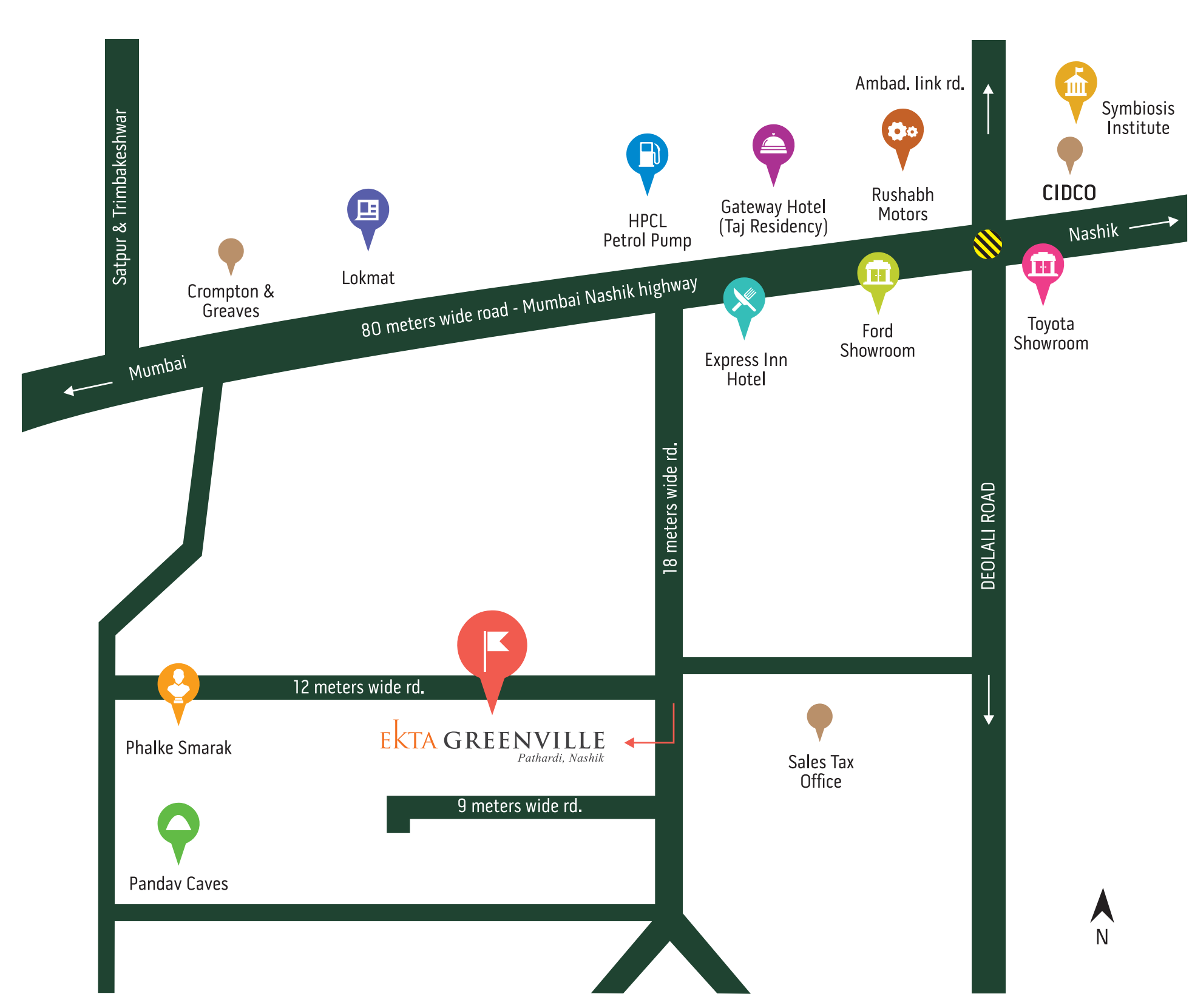
Map not to scale