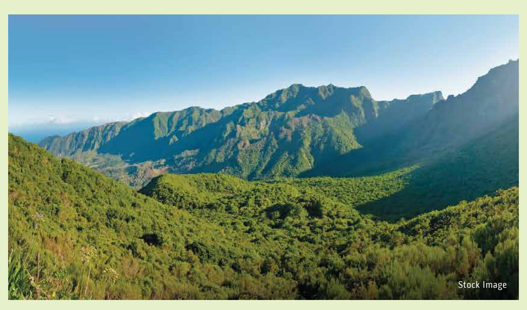
It's a land of tangerine sunsets embroidered with luxury and grace where graciously, we invite you to unlock this chest of a million treasures.

Under a scintillating tapestry of stars far beyond the crowds and clamour tucked between fact and fantasy beautifully lies the stuff of daydreams.