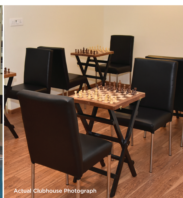
Actual Clubhouse Photograph