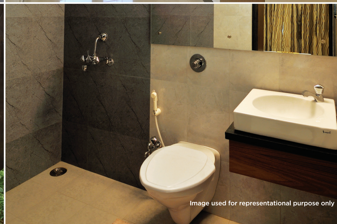
Image used for representational purpose only