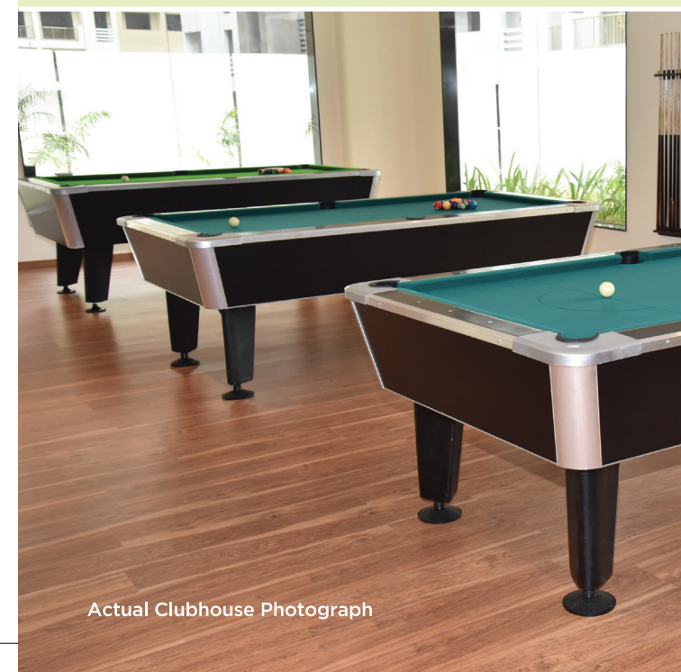
Actual Clubhouse Photograph