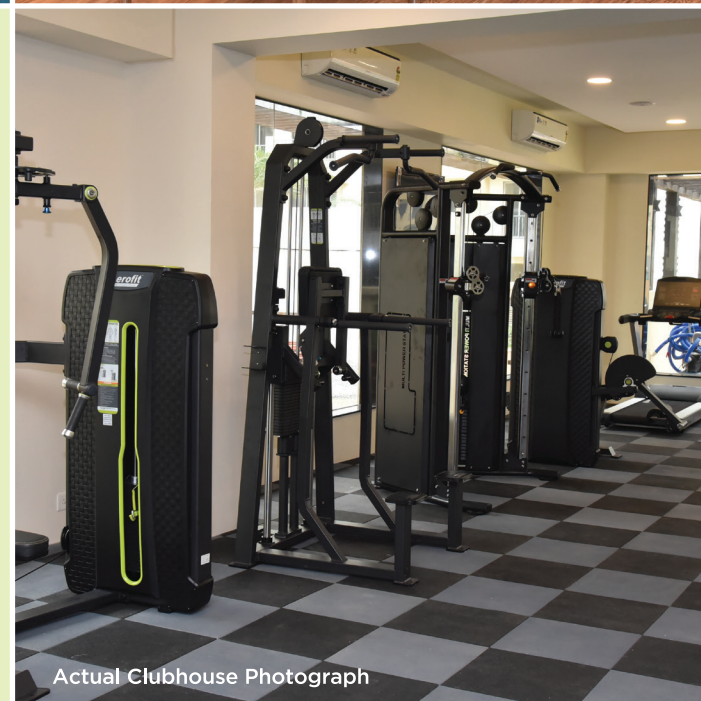
Actual Clubhouse Photograph