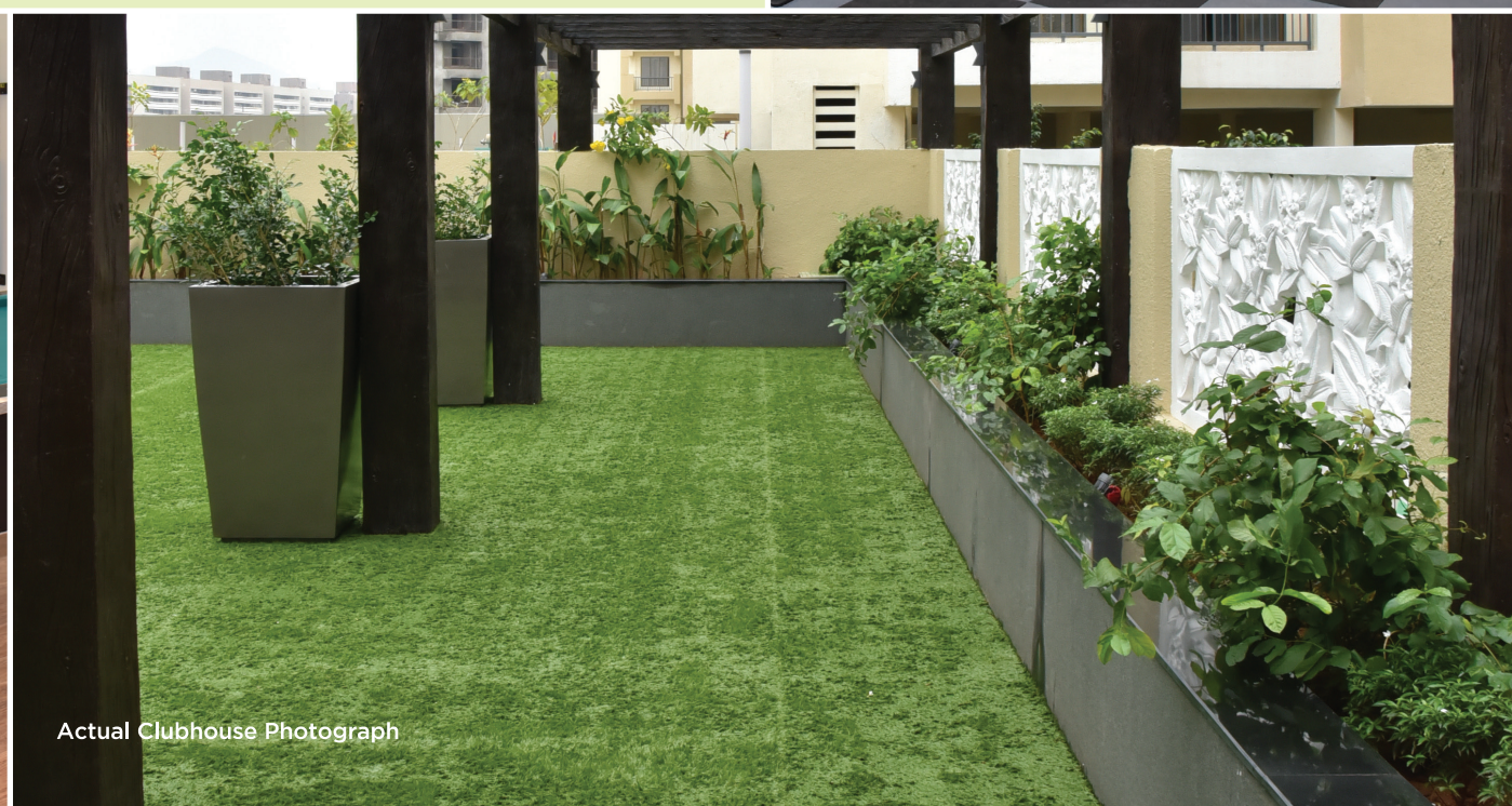
Actual Clubhouse Photograph