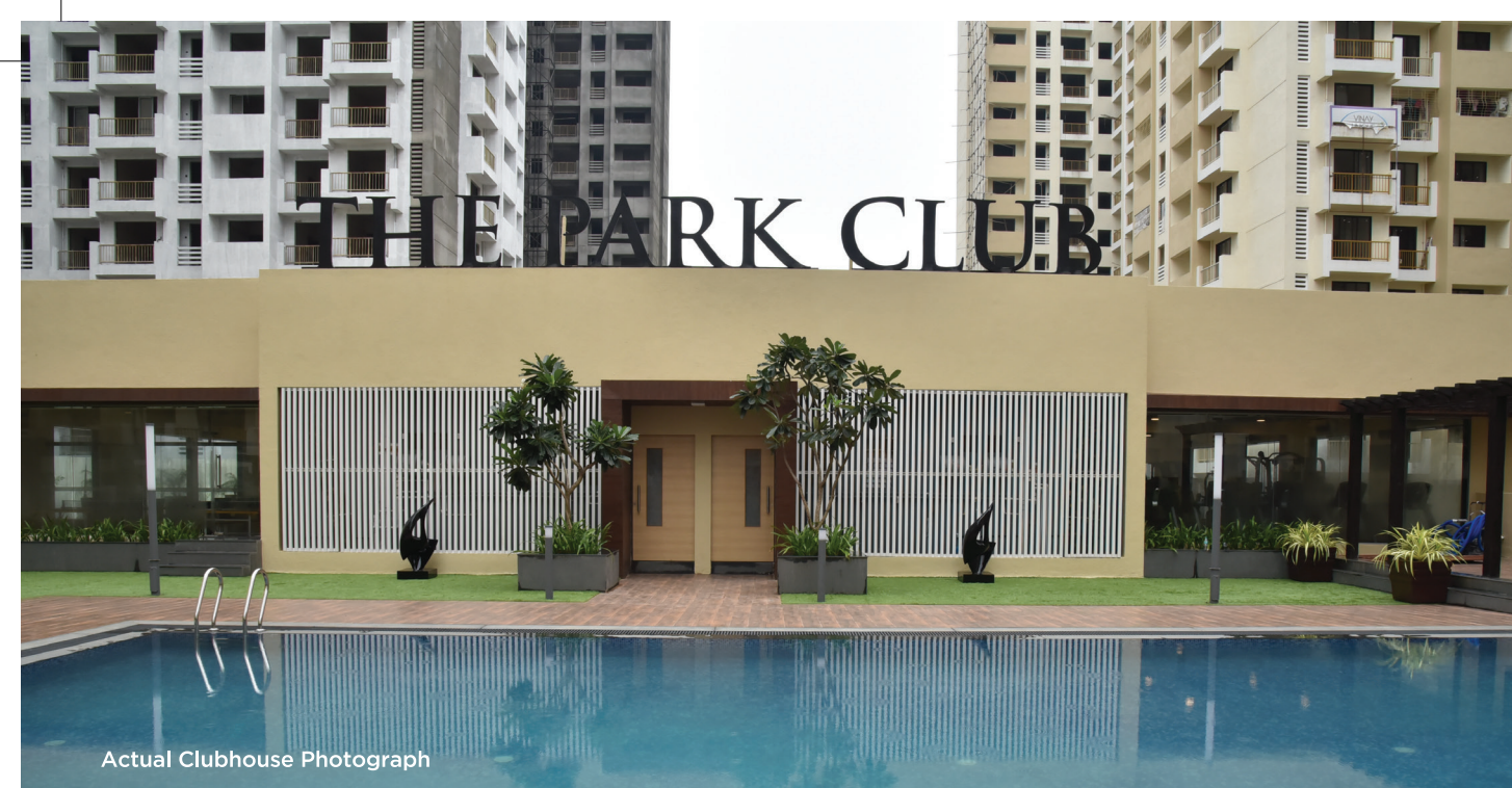
Actual Clubhouse Photograph