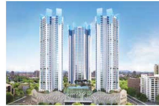
EKTA TRIPOLIS 36 storey residential tower with 2, 3 & 4 BHK luxury apartments at Goregaon (W).