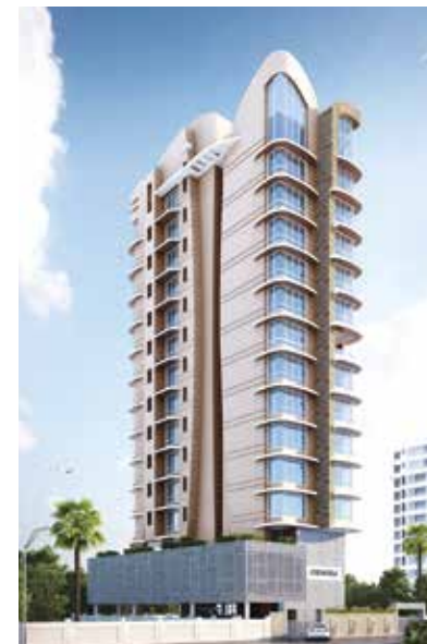
EUDORA 14 storey residential tower with 4 BHK lavish apartments at Khar (W).