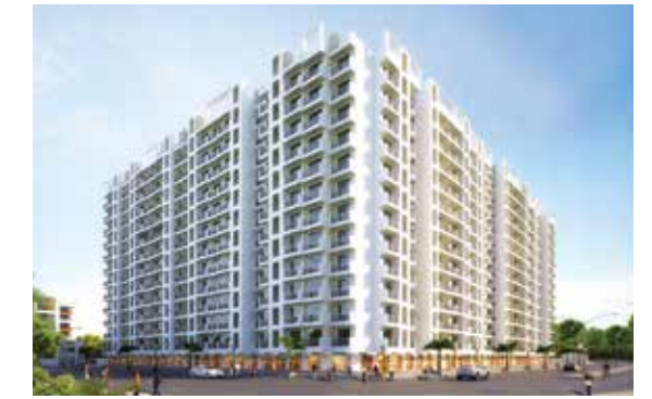
EKTA PARKSVILLE 15 storey residential towers with 1, 2 & 3 BHK Classic and Platinum apartments at Virar (W).