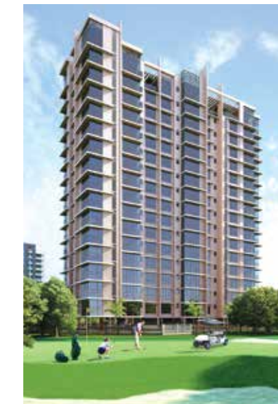
PANORAMA 16 storeyed residential building with 3 & 4 BHK premium apartments in Chembur.