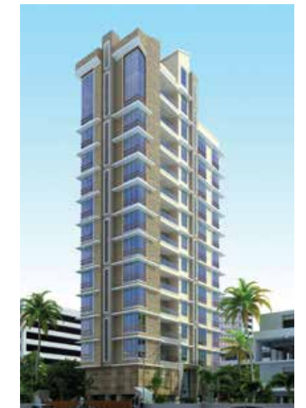
LÈGRANZ A residential tower with 4 BHK ultra-luxurious apartments in Chembur.