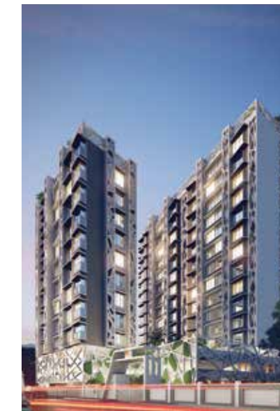
EKTA TRINITY 14 storey residential towers with 2 & 3 BHK luxury apartments at Santacruz (W).