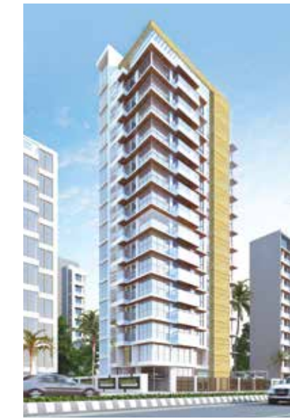
ESTRELLA 14 storey residential towers with 4 BHK iconic residences at Bandra (W).