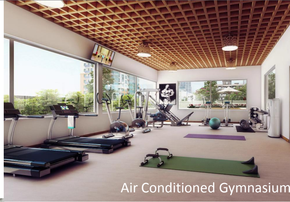
Air Conditioned Gymnasium