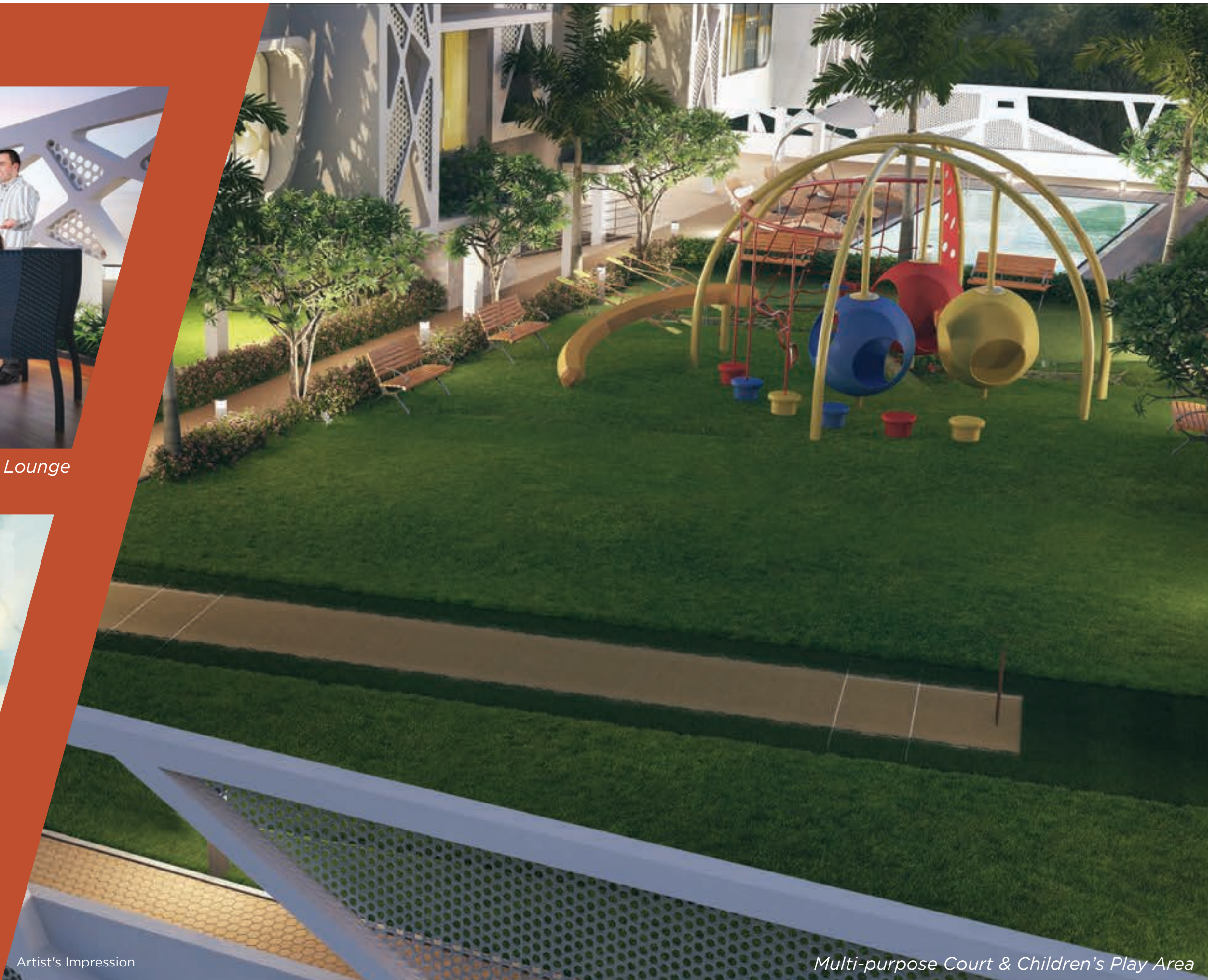
Multi-purpose Court & Children's Play Area